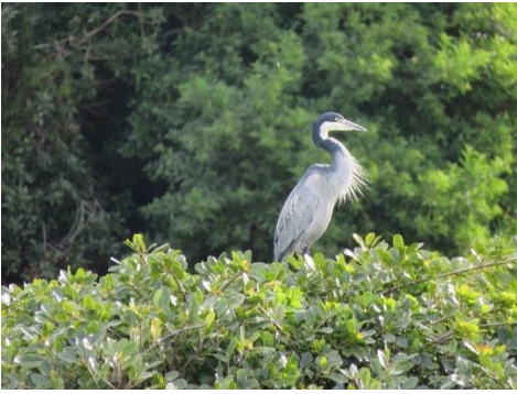
Swartkopreier Black-headed Heron