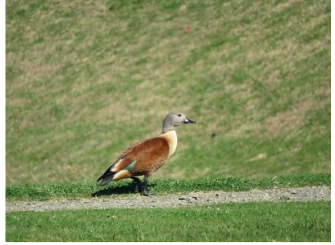
Kopereend South African Shelduck