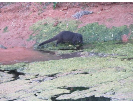
Cape Clawless Otter