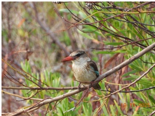
Bruinkopvisvanger Brown-hooded Kingfisher