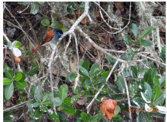
Paradysvlieëvanger African Paradise Flycatcher