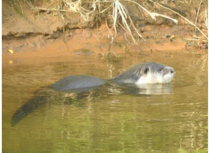
Kaapse Kloulose Otter