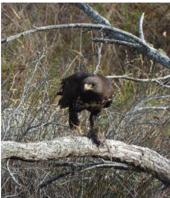
‘n Rooiborsjakkalsvoël Jackal buzzard