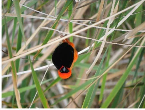
Rooivink Southern Red Bishop